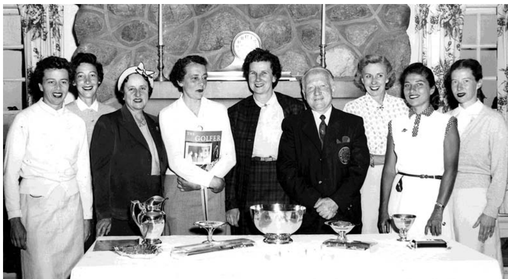
Founders and guests gathered at Glen Ridge for the first tournament: