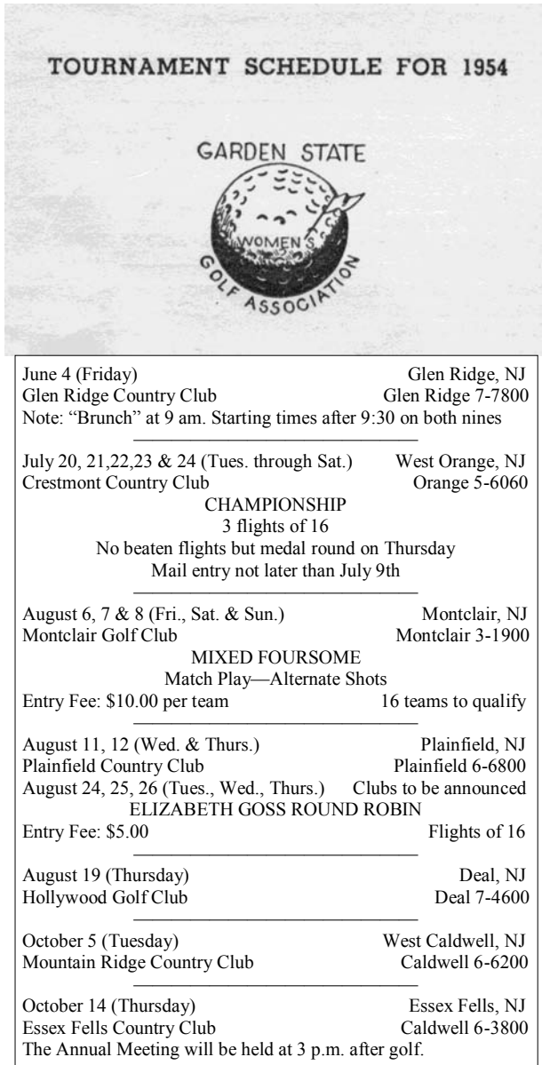
1st Tournament Schedule showing original logo on cover

Spurred by the affluent economy of the '20's, the number of golf clubs and golfers increased, but super highway construction as we know it now was still a long way off, as was the custom of owning multiple cars. A trip to the Jersey Shore from New York City in 1925 took about five hours—and that was making pretty good time! Clearly, more local competitions were needed. Rising to that call were the Women's New Jersey in 1922, Westchester-Fairfield in 1923 and Women's Long Island in 1930.