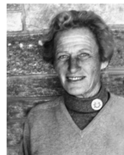
Bobby Doubilet 1962-63